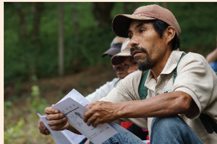
Community member from Quebrada Honda, Municipality of Las Sabanas, Community diploma

Technical staff from Wetlands International, the Nicaraguan Red Cross, CARE, INPRHU, and AMMA, in coordination with the Centroamericana University also facilitated a community diploma aimed at 34 community leaders and members of the Committees of both sub-watersheds with the purpose of encouraging community learning and self-management. This allowed the strengthening of local capacities for community stakeholders in order to guide the implementation process of the plans. A total of 20 user-friendly brochures were drafted for the teaching-learning process in the community diploma, which may be used at schools located in both sub-watersheds and institutions that wish to resume the awareness-raising campaign to promote solidarity in environmental issues in all communities.