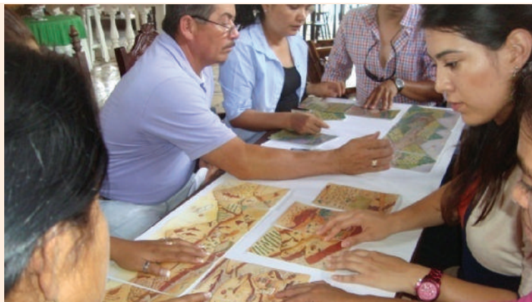
Participants of the higher academic diploma using one of the training tools

The Nicaraguan Red Cross and CARE-Nicaragua, accompanying the municipal governments of San Lucas, Las Sabanas and San José de Cusmapa, are supporting the drafting of the integrated administration and management plans of the Inalí River and Tapacalí River sub-watersheds, providing a planning instrument for local stakeholders present in the territories.