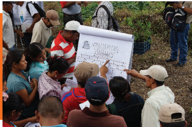
Community diploma participants

Comments from a group of community members of the Inalí river sub-watershed who participated in the 2nd Encounter of the Community Diploma.