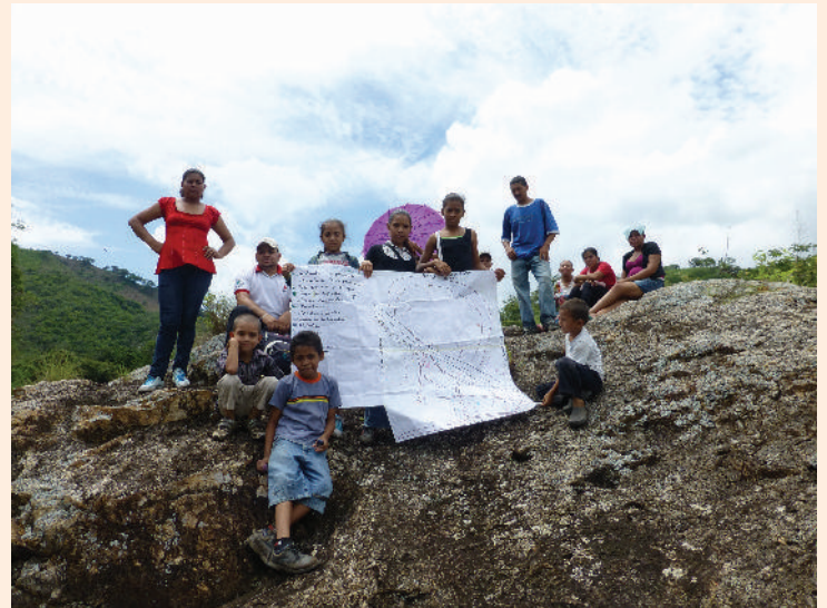
Community members from El Espino, municipality of San Lucas, Tapacalí River sub-watershed

Participation and involvement of local actors are essential to draft a good, integrated administration and management plan for a watershed. Starting with this premise, a gap analysis and mapping of actors who have a presence in the territory were facilitated in the Tapacalí river sub-watershed. The 30 participants of the higher academic diploma given by Universidad Centroamericana facilitated a series of three workshops in each one of the 20 communities of the sub-watershed on environmental considerations and motivation, mapping and participatory analysis of natural resources, and socio-environmental assessments. More than 1,000 residents of the sub-watershed were reached through these workshops. Jaime Antonio Vílchez Escalante, a farmer in the community of Miramar in the municipality of Las Sabanas, explained that this was the first time that many communities were involved in environmental education.