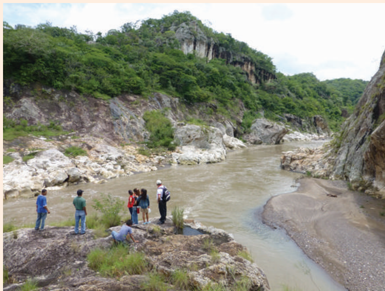
The confluence of the Comalí and Tapacalí streams gives birth to the Coco River.

For example, participants visited protected areas, and witnessed the difference in the health of wildlife and vegetation in protected areas compared to areas without protection. Thus, the effects of deforestation and water pollution became tangible for them. Another important result of the program was the establishment of leader networks with environmental awareness in sub-watershed territories. Jaime Antonio Vilchez Escalante, farmer from the Miramar community, felt good about sharing experiences with others from the sub-watershed territory, since almost all participants share the same goal: to manage the sub-watershed more sustainably.