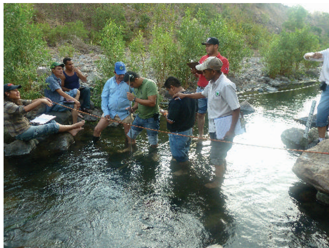
Participants of the higher diploma participated in the information gathering process of the Tapacalí River sub-watershed studies.

In 2013, nine technical studies were conducted in the Tapacalí river sub-watershed: exposure to disaster risks (floods, drought, erosion, landslides), soil quality, water resource inventory and characterization, water quality in the Tapacalí river and its tributaries, water balance (water supply and demand), and an agro-climatic study with a climate change adaptation approach. In addition, biophysical, socio-economic, institutional, and legal assessments were carried out, and a thematic mapping of the sub-watershed was developed, which allowed the drafting of the sub-watershed atlas. This information has its own database, which will be donated to the municipalities sharing this territory. The integrated sub-watershed administration and management plan will be drafted for the short, medium and long terms. In order to facilitate dissemination at community level, the plan will be designed in a popular version after the planning instrument has the technical approval of the National Water Authority (ANA) and has been disseminated among institutions and recognized at the local level by municipal governments through municipal ordinances.