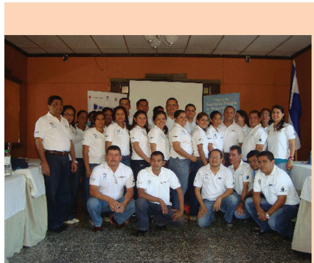
Higher Diploma participants (UCA-NRC agreement)

Meetings to present the plan drafting process were held at municipal level to obtain approval by the Municipal Councils of San José de Cusmapa, Las Sabanas, San Lucas and San Marcos de Colón-Honduras. At institutional level, the authorization for the drafting of Watershed Plans was received from the National Water Authority (ANA) and the initiative was presented to the Ministry of Environment and Natural Resources (MARENA).