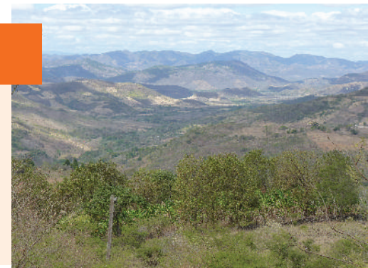
Panoramic view of the Inalí River Sub-watershed from the road leading to Las Sabanas

Reflection from a community member who participated in the Environmental Awareness and Motivation Workshop in La Fuente community, Tapacalí river sub-watershed.