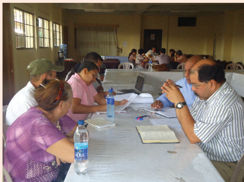
Photo: Drafting the 2012 POA for the Rosquilla producers Value Chaining Committee

The results highlighted all the strengths and weaknesses in the Committee where PfR partners could work on strengthening knowledge and learn about topics such as DRR/CCA/EMR. As part of the public/private sector –which includes government agencies, guilds, rosquilla businesspeople, individual or collective producers, the Value Chain Committee, for a total of about 45 persons– it represented an interesting opportunity to work and support the collaboration between the public and private stakeholders.