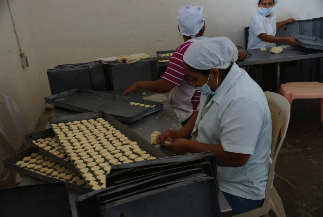
Photo: Rosquilla production process with good manufacturing practices, Somoto, Madariz

The PfR framework helped public and private 12 stakeholders become aware of the work approach that integrates the Resilience principles 13 .