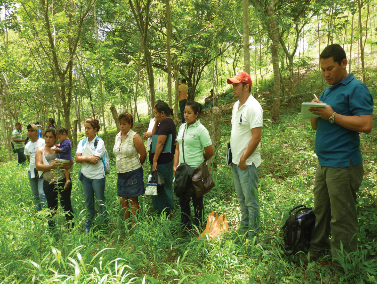
Photo: Exchanging experiences in energy forests

In a second stage, PFR acknowledged that there was fluctuation regarding participation and plan implementation and that it was necessary to strengthen the committee value chain. Therefore, PFR considered necessary to develop a study to identify weaknesses for instance in the regulatory framework, the organizational cohesion of the Committee and the articulation of efforts through public and private partnerships.