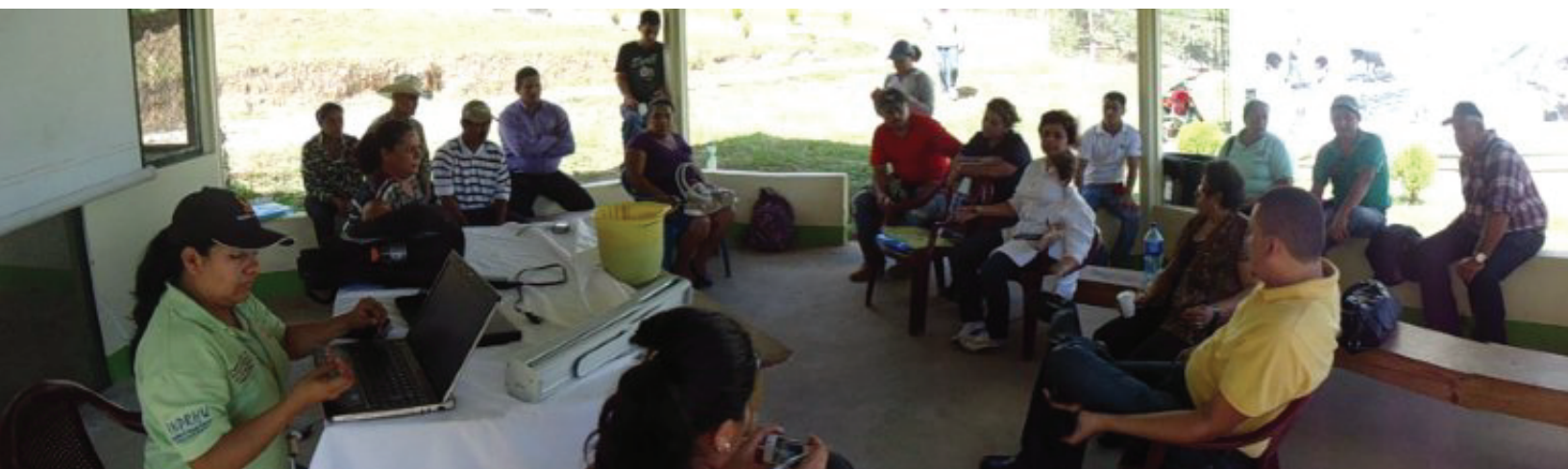
Photo: Planning session with the Rosquillas value chaining committee

A practical demonstration of topics related to climate change was made visible in the experience exchange, when the Committee members noticed that usage of candy preparation waste could contribute to climate change mitigation and adaptation. Reusing waste from candy preparation is a mitigation measure because it uses clean energy. It can also be considered an adaptation measure because reusing waste decreases the need for firewood, which prevents deforestation and, consequently, results in soil quality improvement and greater water preservation.