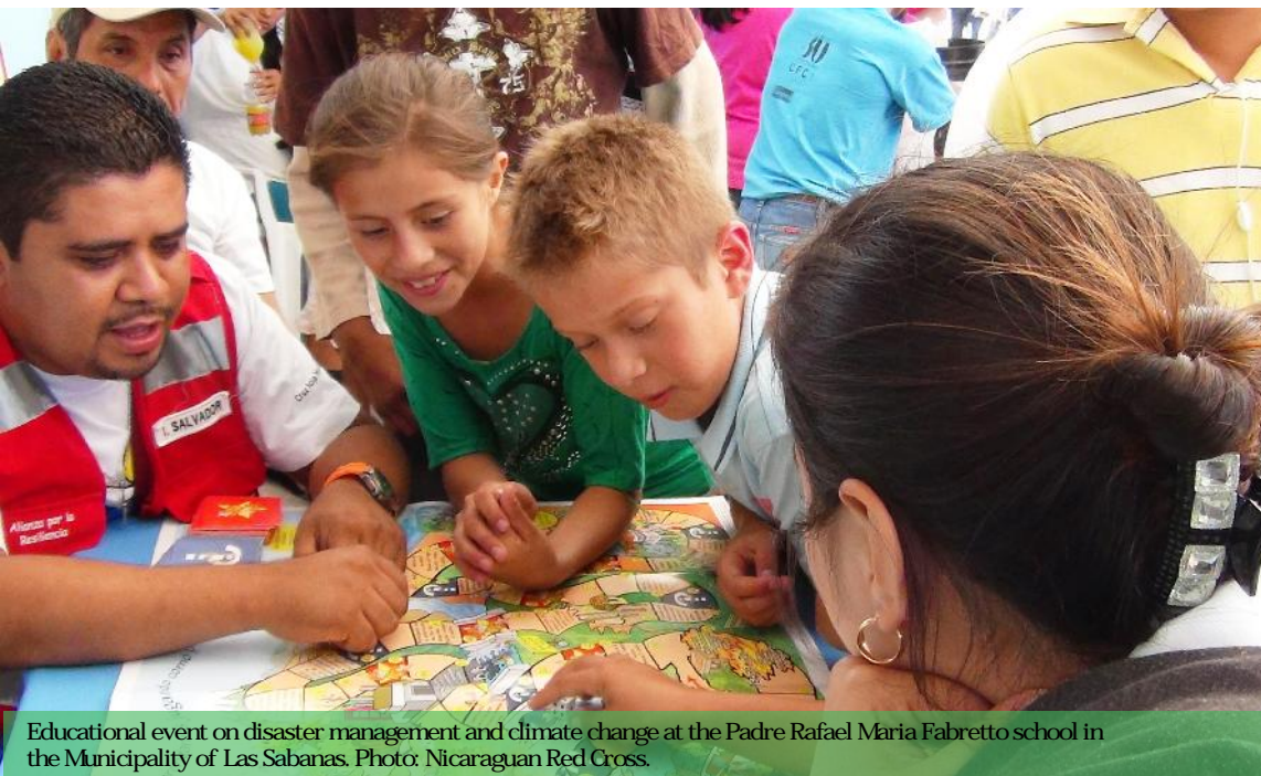
Educational event on disaster management and climate change at the Padre Rafael Maria Fabretto school in the Municipality of Las Sabanas.