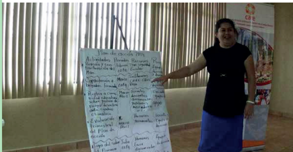
Teacher of the Instituto Cristo Rey presenting their 2014 action plan to be implemented in coordination with the Local Education Council of San Lucas.

Twenty-six comprehensive school safety brigades were also formed, trained on first aid, psychosocial support, search and rescue, evacuation, and fire prevention and control. In addition, 32 schools were provided with school safety equipment and prevention and mitigation actions (reinforcement works like retaining walls, reforestation, the replacement of a community preschool) were implemented in those schools that required them.