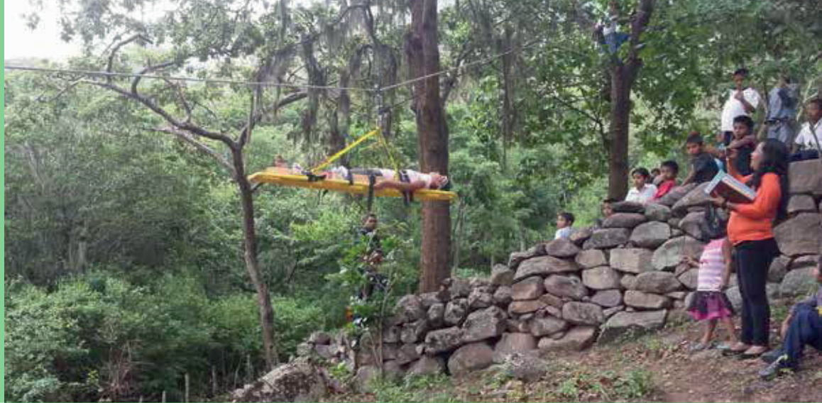
Children evacuation drill, simulation of landslide due to heavy rains, school of the rural community of El Chichicaste, San Lucas, Madriz.