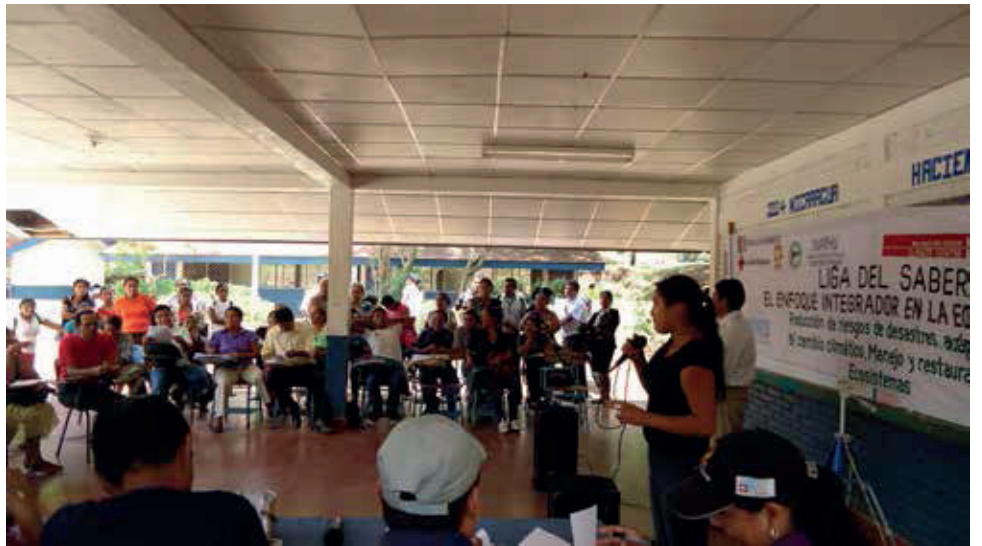
Knowledge competition on DRR, CCA and MRE with primary and secondary students of the Cristo Rey Institute of the municipality of San Lucas, Madriz.

The construction of a community preschool, which also functions as a temporary shelter, and community centers in the community of El Coyolito.