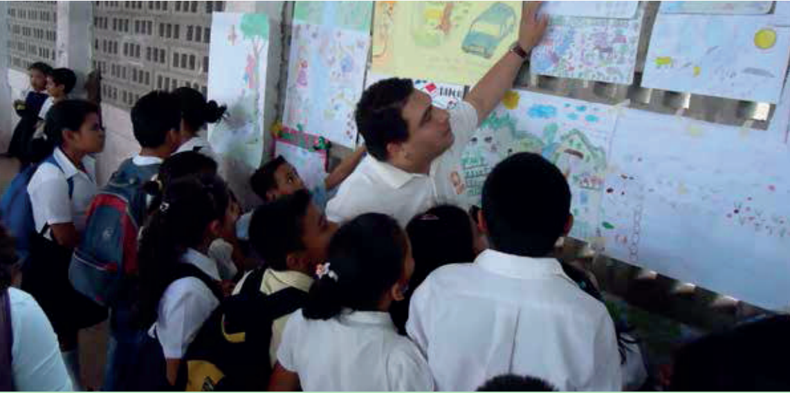
Sensitization campaign: exhibition of drawings by children from different schools of San Lucas (Madriz) for the drawing competition "This is how I want the environment of my community to look like".