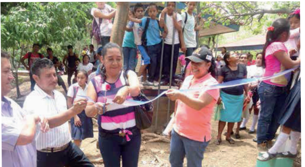
Municipal authorities inaugurate Cristo Rey Institute's microproject of the urban centre of the municipality of San Lucas.