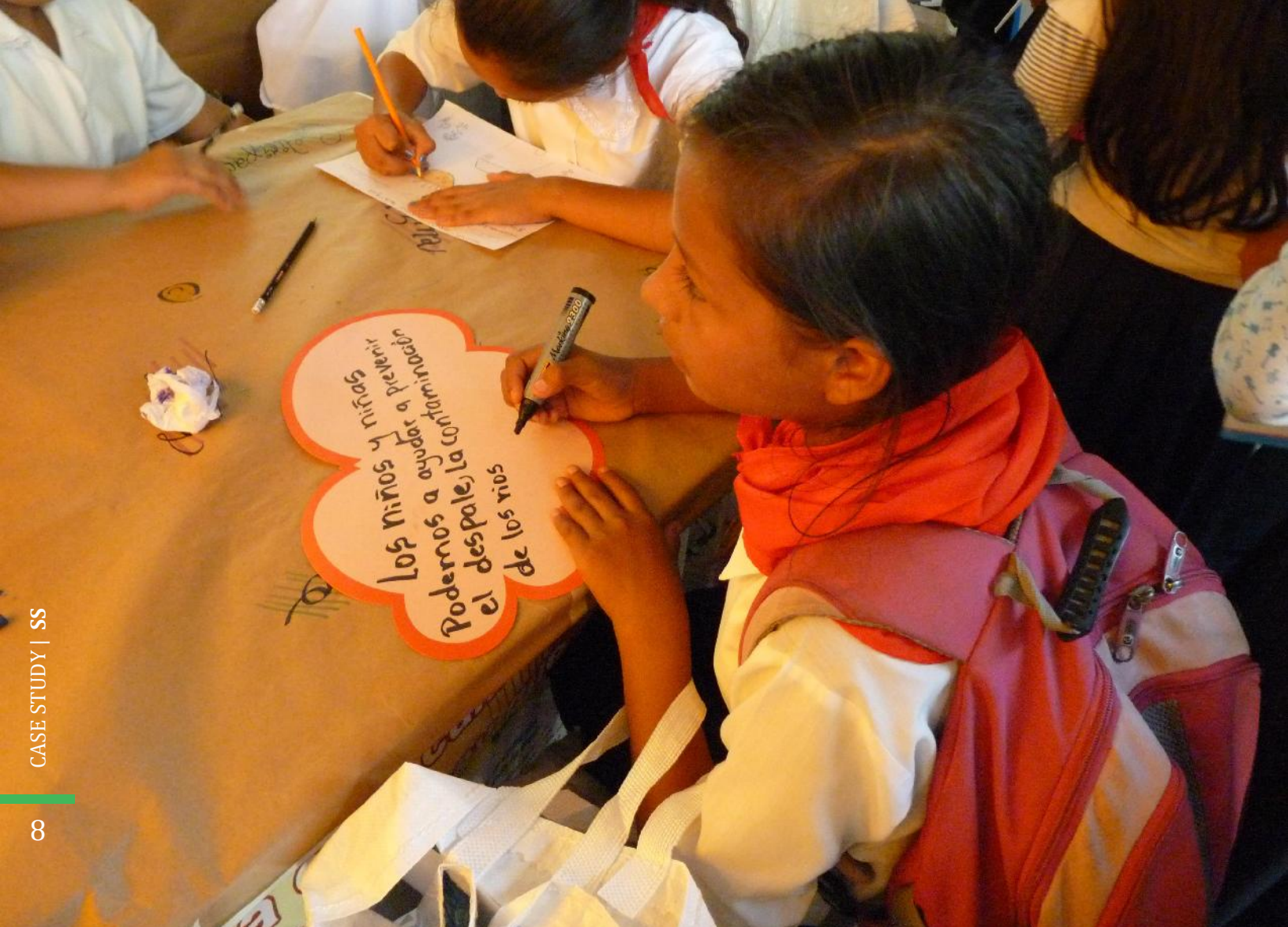
Girls participating in the celebration of the International Disaster Reduction Day, Somoto, October 2012.