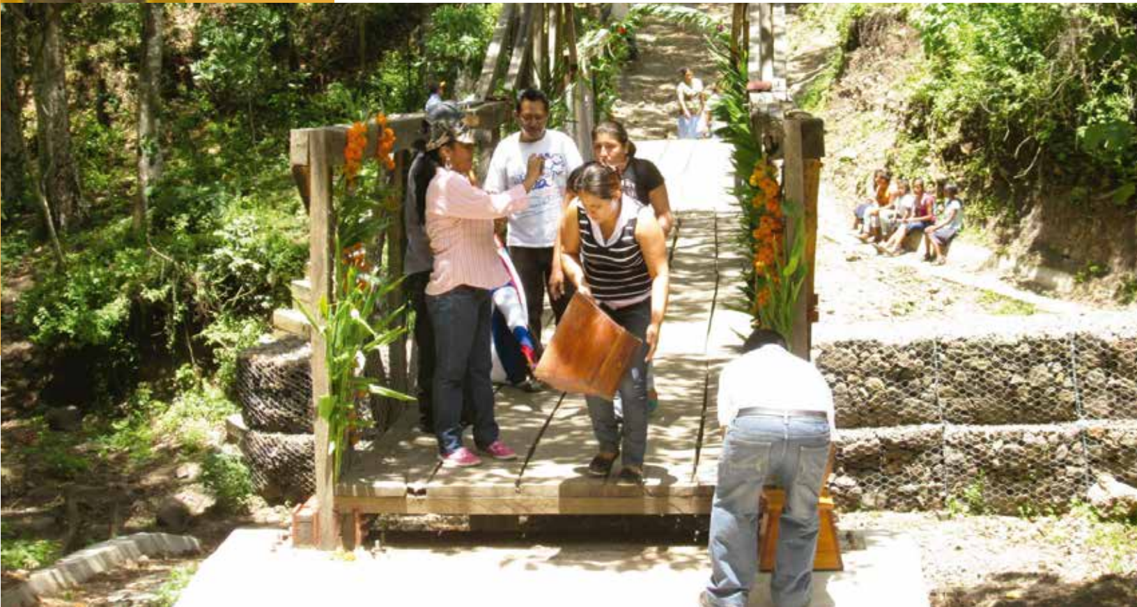
The municipal mayor at the inauguration of the footbridge in the community of El Rodeo.