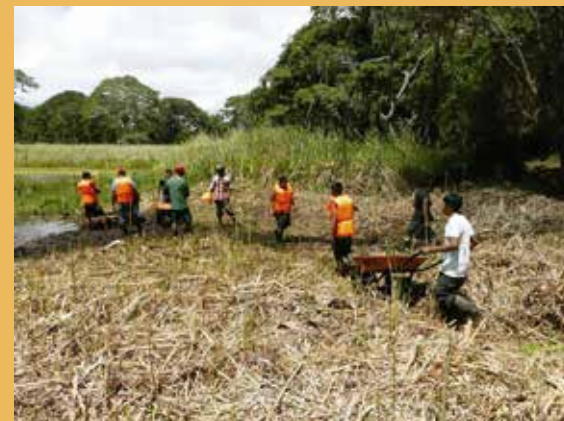
Inhabitants of El Pegador cleaning-up the water mirror of the La Bruja Lake in Las Sabanas.