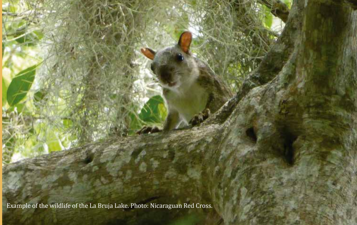
Example of the wildlife of the La Bruja Lake.