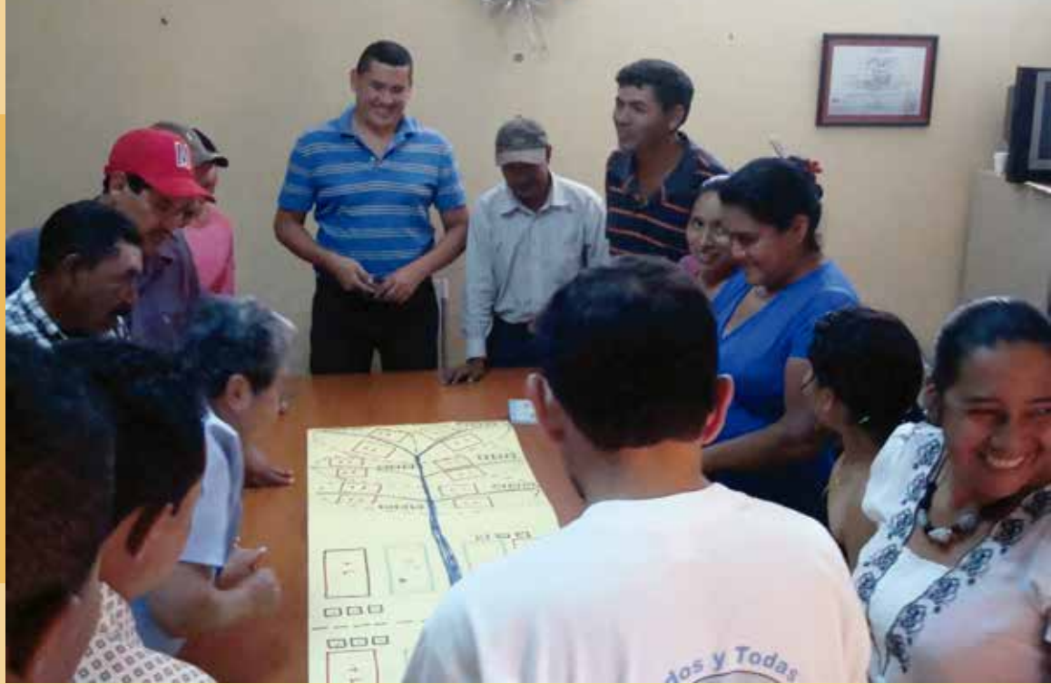
The San Lucas Municipal Council playing the PFR Program's "Upstream, Downstream" game during an ordinary session.