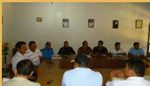
Different activities carried out to promote local governance: joint work sessions with organizations and institutions together with the municipal council and the Departmental Disaster Prevention Committee.