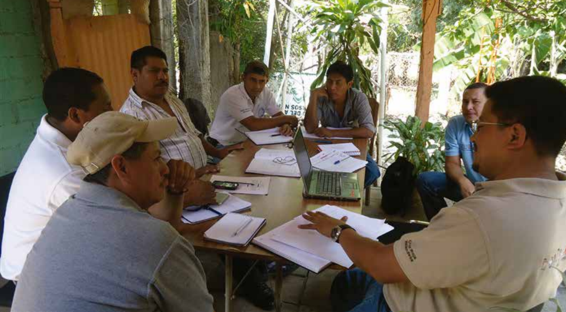
Coordination and dialogue session with local governments and state institutions for joint planning.