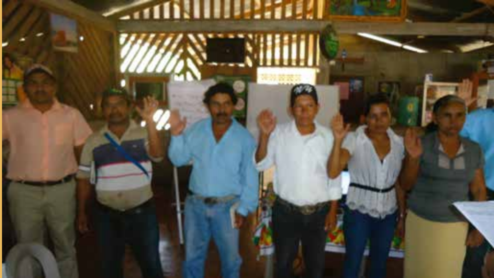
Swearing in of the Inalí River Sub-Watershed Committee.