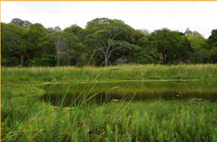
La Bruja lake, El Pegador, Las Sabanas, department of Madriz.

The departmental office of the Ministry of the Environment and Natural Resources in Madriz is promoting a national-level process to declare the lake a wetland.