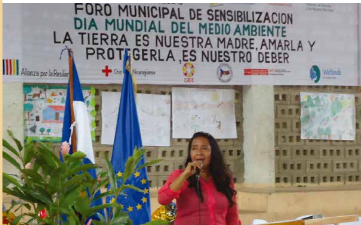
San Lucas' municipal mayor, Deysi Pérez Vásquez, during a municipal environment forum.

The active participation of the population, community-based organizations, civil society, government institutions and non-governmental organizations strengthens capacities for project assessment, prioritization, attainment, execution and supervision.