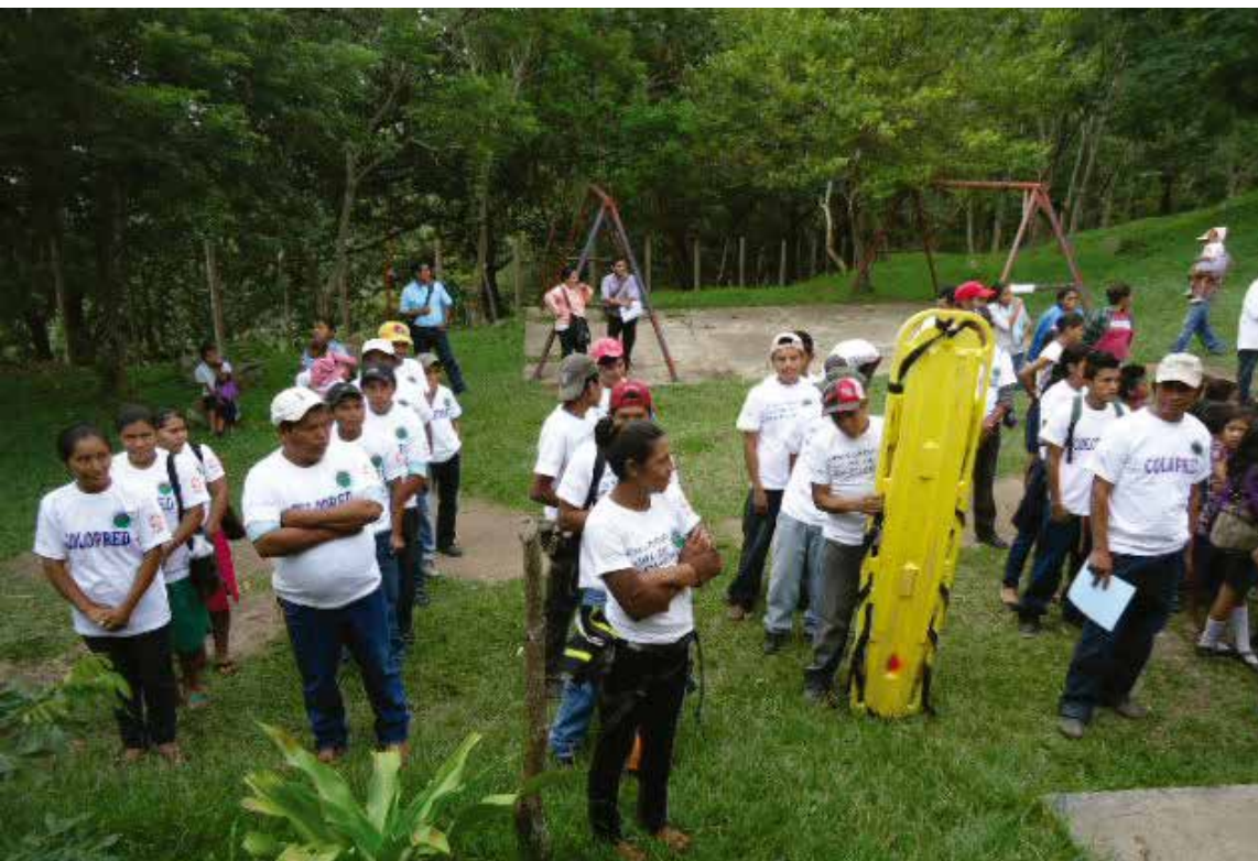
Response of the local government of San Lucas, the communities' local disaster prevention committees (COLOPREDs) prepared to respond to disasters.

The model for working in alliance promoted by PfR is an instrument that has facilitated coordination and fund complementarity for local governments.