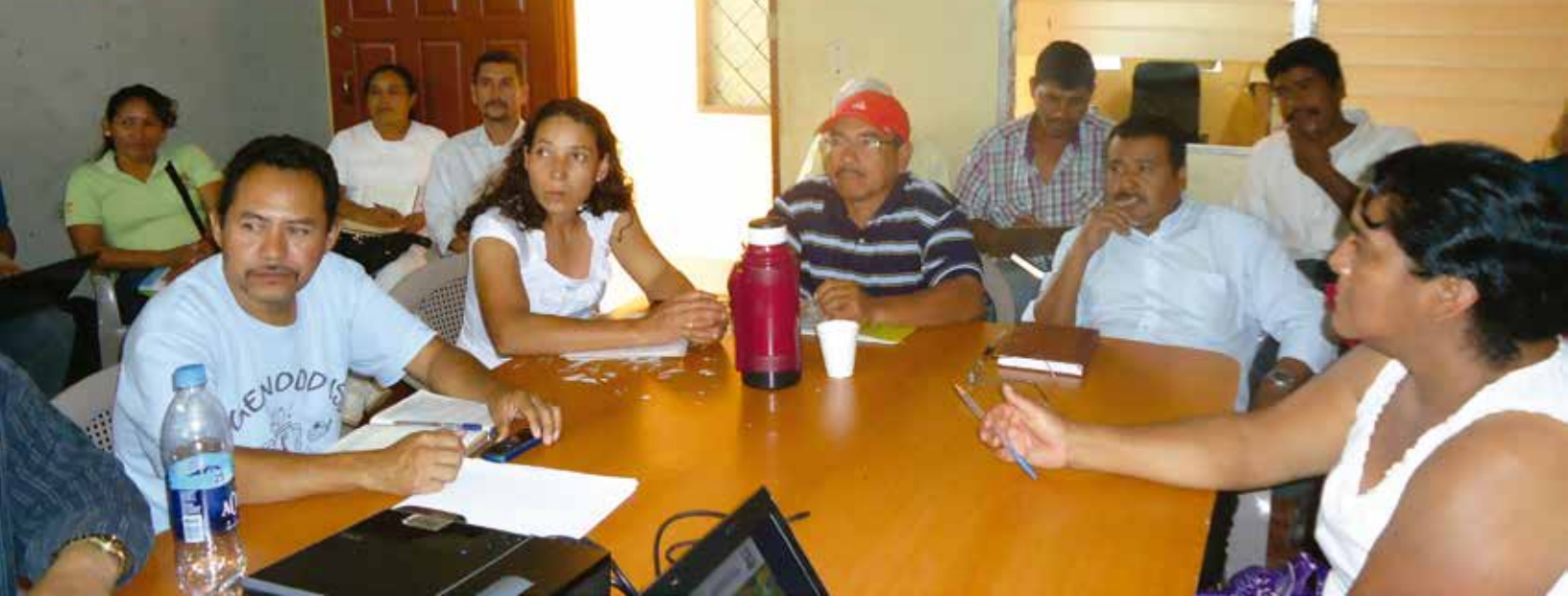
Municipal council session on the negotiation of amounts for community microprojects.