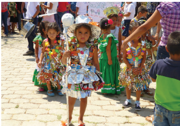
Fancy-dress competition involving costumes made of recycled materials worn by preschool girls from San José de Cusmapa during the food fair held in April 2013.

Women’s participation was also fundamental in the holding of workshops on natural medicine and alternative foods that were organized in the framework of the Harmonization of Indigenous and Local Knowledge. 9 This in turn allowed the design and staging of a food fair under the slogan “Human health is a reflection of the Earth’s health.” 10 The fair was held in April 2013 in San José de Cusmapa, its main objective being to promote the recovery of native seeds and locally-produced alternative foods and their inclusion in the family diet. The fair also raised the population’s awareness of reusing solid waste by transforming it into useful products.