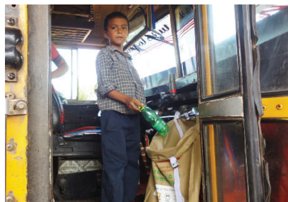
Campaign to raise awareness of garbage management in the Northern Caribbean Coast Autonomous Region.

In conjunction with the United Nations Development Program (UNDP) in the Segovias region, Partners for Resilience trained local journalists on subjects related to disaster risk reduction, climate change adaptation and ecosystem management and restoration.