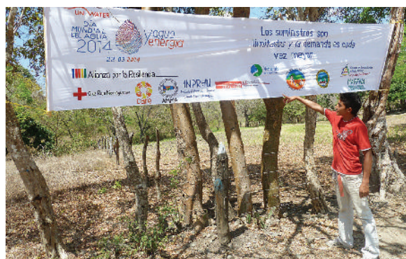
The celebration of World Water Day involved the organization of micro-watershed clean-up campaigns in 2014.

“Today we are starting to clean up the Quebrada Sucia micro-watershed. This work we are doing in alliance and complementarity with PFR has been strengthening all of the social aspects we’re promoting. This clean-up campaign is designed to make us alert to prevent all risks of flooding due to the accumulation of garbage in the brook. We have to really emphasize the areas of greater risk, such as the border communities, and void the propagation of dengue, eliminating pools of water and garbage throughout the municipality. With everyone’s participation we can eradicate the centers of infection to avoid illnesses.” The mayor of San Lucas, Deysi Pérez Vázquez, at the launch of the 2014 awareness-raising campaign under the slogan “Clean micro-watersheds give us clean water.”