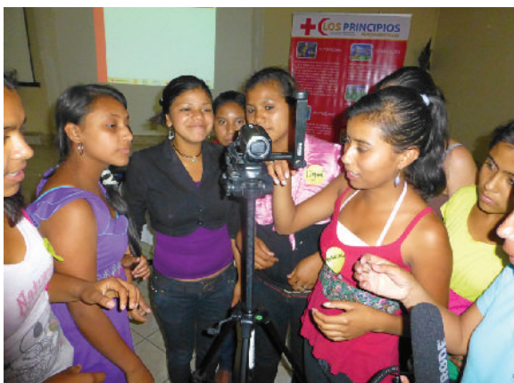
Participatory video workshop with networks of young people from Las Sabanas and San José de Cusmapa.

Starting in 2013 with support from the organization Pool de Trainers 12 , participatory video was promoted as a social strengthening tool to improve basic skills for documenting changes in attitudes and practices and for promoting culture and decision-making. The messages produced, filmed and edited by young people were shown to the community, decision-makers and donors. The process started with learning to use the video equipment and an editing program. Pool de Trainers also produced a documentary on the Tapacalí River sub-watershed, providing a tool with which to continue sensitizing the population on the area they live in.