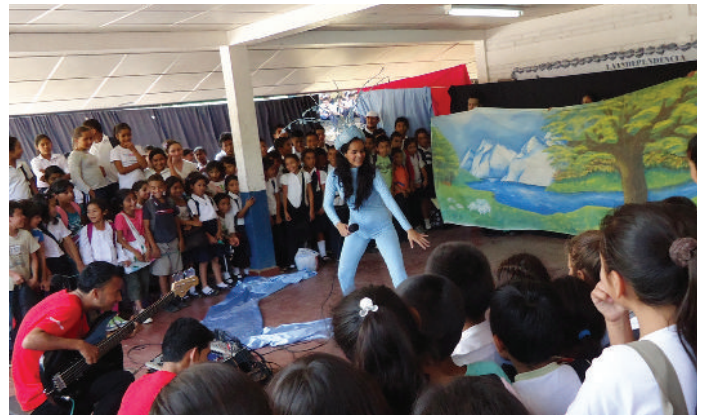
A play presented at rural schools in the municipality of San Lucas.

In the municipality of San Lucas, for example, over 1,200 children, teachers and parents were sensitized. With support from the Ministry of Education (MINED), small school forums were promoted in preparation for the municipal environment forums organized in 2013 and 2014. The children and parents promised to ensure reforestation, the recycling of solid waste and river watershed management in the schools.