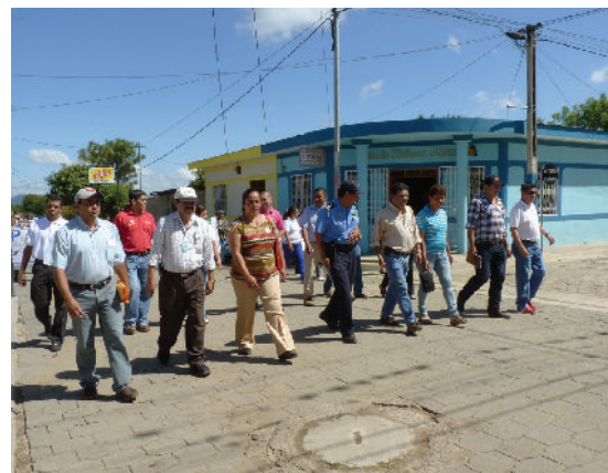
Authorities, institutions, civil society organizations, local disaster prevention committees, and school brigades marching in the city of Somoto in celebration of International Day for Disaster Reduction, October 2012.

The Program’s Visibility Strategy formed the basis for this awareness-raising and education campaign, defining the groups that needed to be worked with according to their particular characteristics and interests. The following groups were included: local authorities, community leaders, religious leaders, teachers, donors active in the sector, non-governmental organizations, indigenous populations and opinion formers.