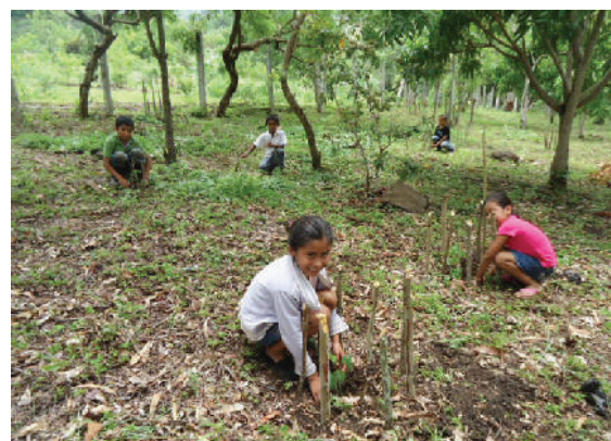
Reforestation campaign in rural schools of San Lucas.