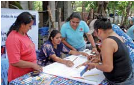
Red Cross volunteers in Guatemala show a new water treatment system with enough water for 85 households and a school.

The Reference Centre for Community Resilience (CRREC) specializes in methodologies for investigating, systematizing, validating and analysing community education with respect to disaster preparedness, prevention, mitigation, and early warning. By developing innovative and complementary tools and methodologies, it aims to reduce the vulnerability of communities across Latin America.