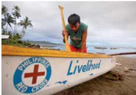
A resident prepares his boat before sailing to fish with the help of the Philippine Red Cross livelihood assistance project after Typhoon Bopha.

The Livelihoods Resource Centre (LRC) spreads awareness of effective livelihoods programming strategies, and helps IFRC members to enhance community capacity and individual skills, restore and sustain sustainable livelihoods, and thereby establish more secure living conditions. The LRC is also a network of community-based livelihood experts, who can pass on knowledge, develop methodologies and policies, build capacity, and provide technical assistance.