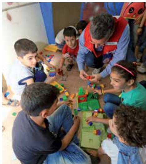
Volunteers play with a group of children at the psychosocial centre in Dweila, Syria.

The Reference Centre for Psychosocial Support (PS Centre) assists National Societies to provide psychological and psychosocial assistance, raises awareness of psychological reactions to disaster and social disruption, promotes restoration of community networks and coping mechanisms, and improves the provision of emotional support to staff and volunteers.