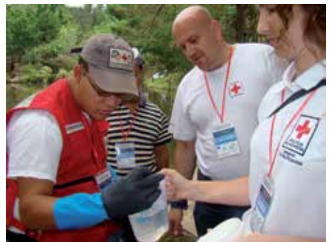
Participants at regional Water and Sanitation training.