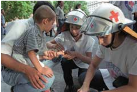
Argentinian Red Cross volunteers provide first aid to community members.

The Global First Aid Reference Centre (GFARC) is the IFRC's technical expertise hub, providing first aid information and related support to Red Cross and Red Crescent National Societies around the world.