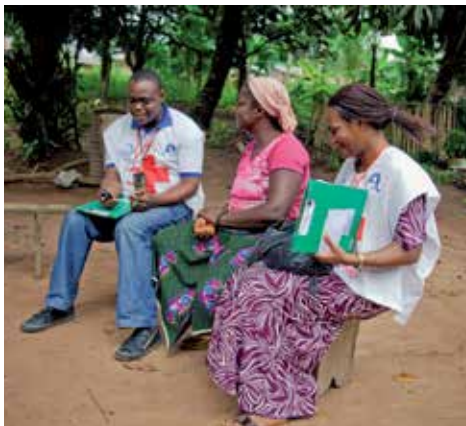
Nigerian Red Cross volunteers conduct an interview as part of the on-going monitoring survey in Cross River State.

The Centre for Evidence-Based Practice (CEBaP) of the Belgian Red Cross provides scientifically substantiated information, advice and support to Red Cross and Red Crescent partners in order to determine which activities are most effective and to create uniformity among the various activities of National Societies. CEBaP aims to create a bridge between science and practice and offers support to the Belgian Red Cross for policy implementation.