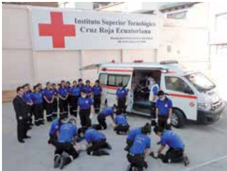
Students attending CPR session at the Ecuadorian Red Cross Technological Institute facility.

The Regional Reference Centre for Medical Emergencies and Pre-hospital Care (CREMYAP) aims to assist members of the International Federation of Red Cross and Red Crescent Societies in the Americas in strengthening National Red Cross and Red Crescent Societies' capacity in providing pre-hospital care through the development of methodologies, tools, learning techniques, and harmonized processes, taking into account the existing knowledge and best practice of the global network of National Societies.