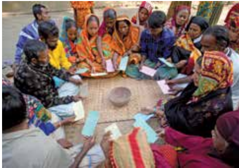
Residents practice using a participatory tool that allows communities to improve their living environment, build safer shelters and design better settlements.

The Global Disaster Preparedness Centre (GDPC) helps to enhance the disaster preparedness capacities of Red Cross and Red Crescent national societies and the wider humanitarian community. It provides specific network-wide services in response to national and community demands for tools and learning on disaster preparedness and resilience.