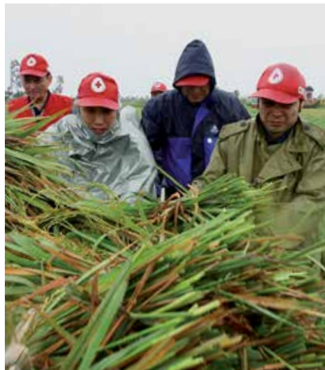
Vietnam Red Cross staff and volunteers support communities on the coast to bring in their rice harvests ahead of a typhoon.

The Climate Centre supports the Red Cross and Red Crescent Movement and its partners in reducing the impacts of climate change and extreme weather events on vulnerable people.