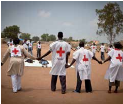
South Sudan Red Cross volunteers take part in a training in preparation for the independence celebrations.

The Reference Centre on Volunteering develops, promotes, facilitates and manages knowledge on volunteer management and volunteering development in Europe.