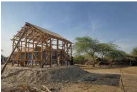
As part of its disaster preparedness programme, the Pakistan Red Crescent Society is constructing homes on higher ground to ward off flooding should river waters rise again in the upcoming monsoon season.

The IFRC-SRU focuses on protecting people from shelter-related vulnerabilities and risks after disasters. It was established by Benelux Red Cross Societies and the IFRC Shelter and Settlements Department in Geneva to improve humanitarian shelter interventions by strengthening the technical capacity and resources of the Red Cross Red Crescent Movement.