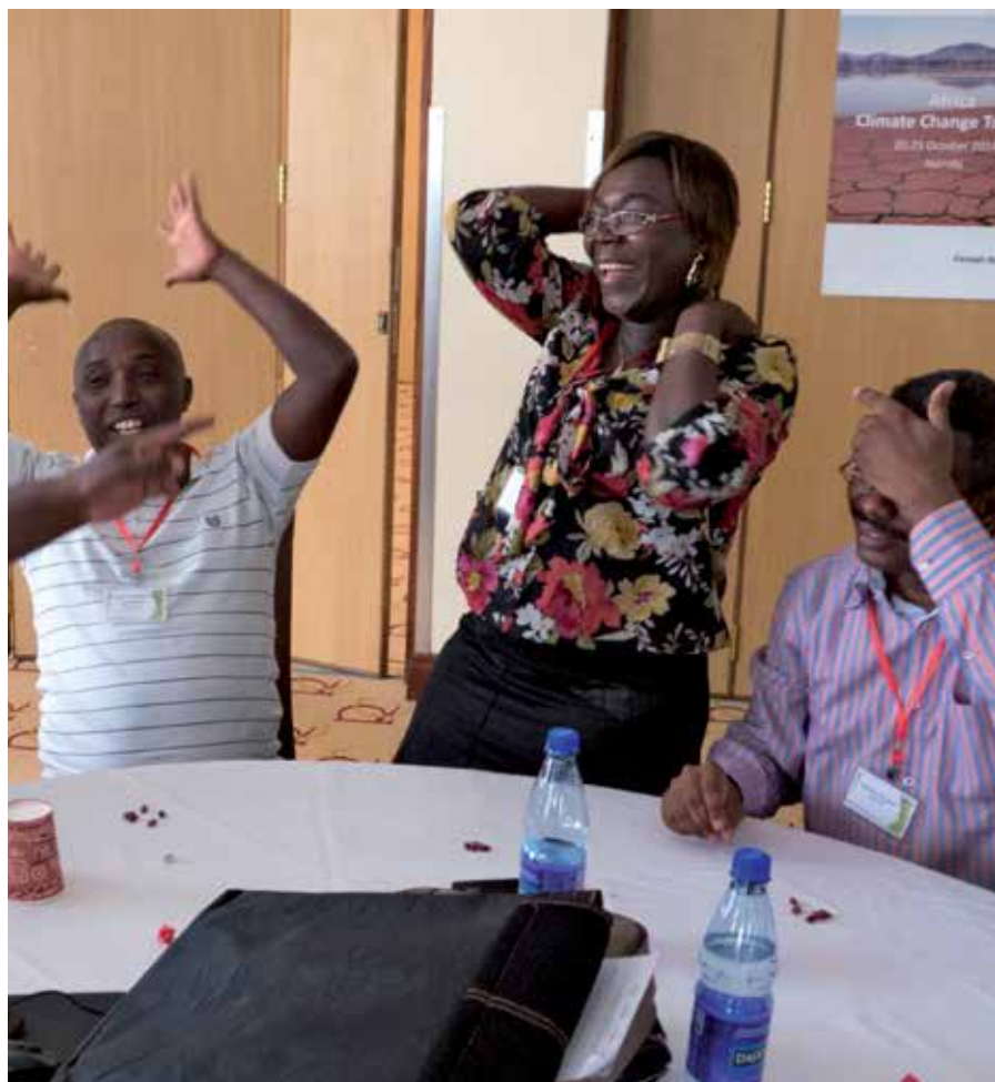
Africa Climate Change Training, Nairobi, October 2014