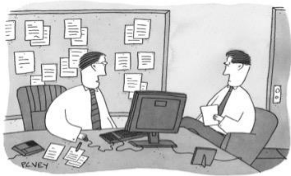
"Sometimes I think the collaborative process would work better without you."

With participants including high-level representatives of the World Bank, national governments, insurance companies and civil society, this event included a 30-minute humor-infused session focused on “ challenges and opportunities we confront when setting up collaborations and partnerships, esp in the context of climate risk finance and insurance solutions. ”