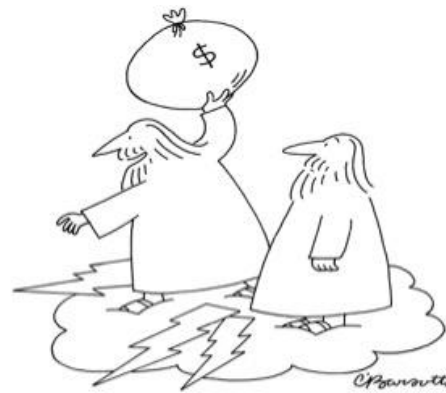
"You'll see, this is going to cause real trouble."