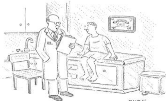
"Uh-oh, your coverage doesn't seem to include illness."