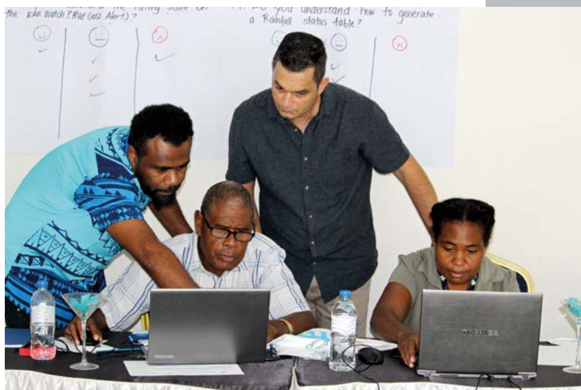
Inter-agency workshop on drought monitoring, Solomon Islands, May 2018