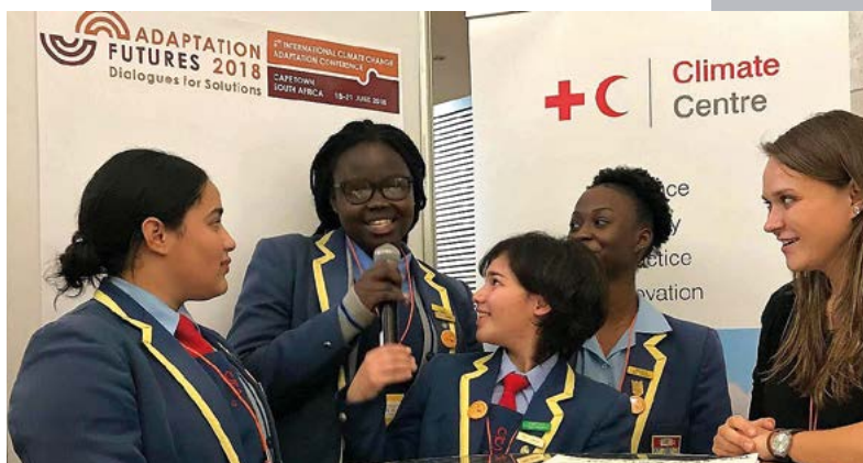
First Adaptation Futures in Africa, the community kraal, June 2018

Many international conferences were enhanced with our interactive approaches: Adaptation Futures included a community kraal , while the role of cooks in eradicating world hunger was highlighted at D&C Days in collaboration with IFAD.