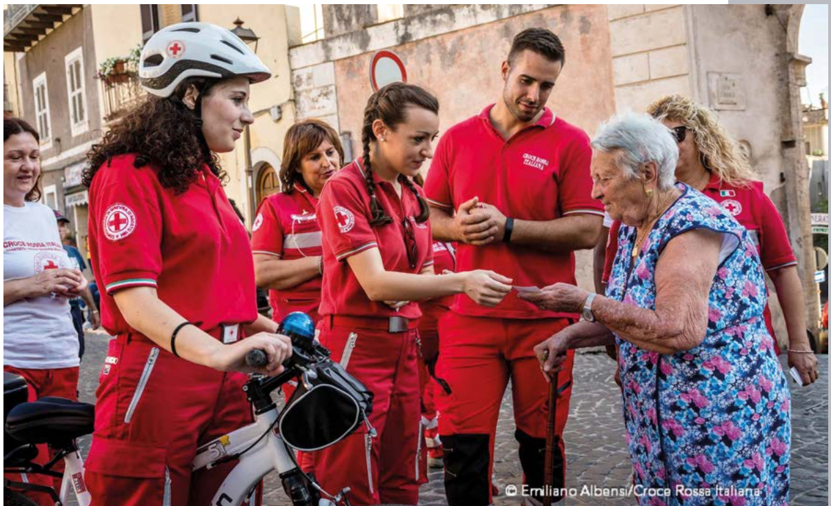
Italian Red Cross volunteers assist elderly people cope with summer heat, 2018