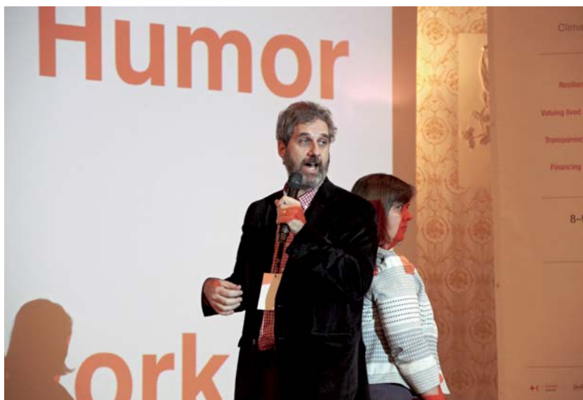
Session on humor at D&C Days, December 2018

– UK Department for International Development press release, 16 April 2018 ( Lloyd's of London, innovation and finance event )