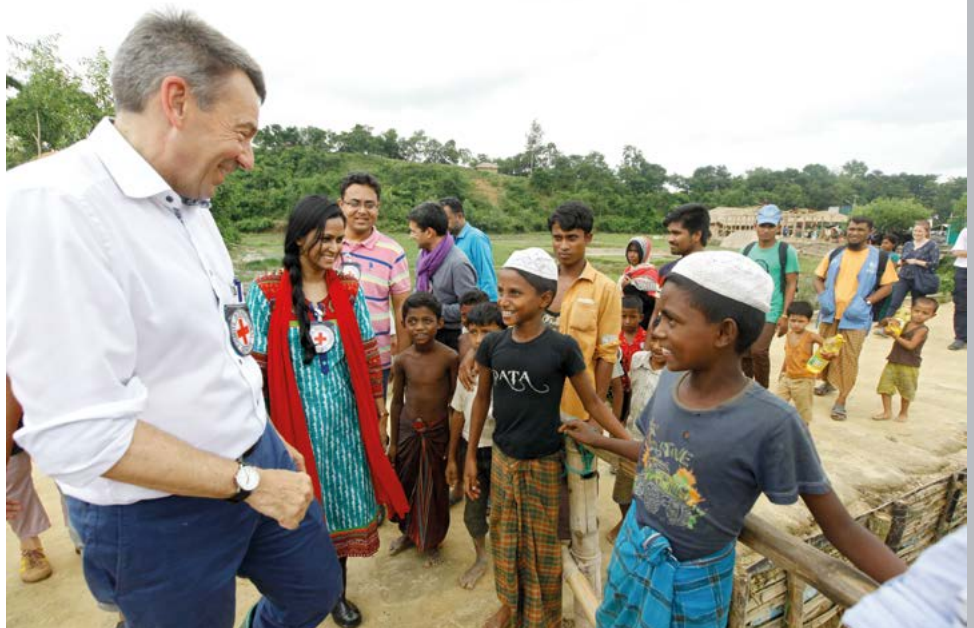
ICRC President Peter Maurer visits Chakmarkul camp, Cox's Bazar, July 2018