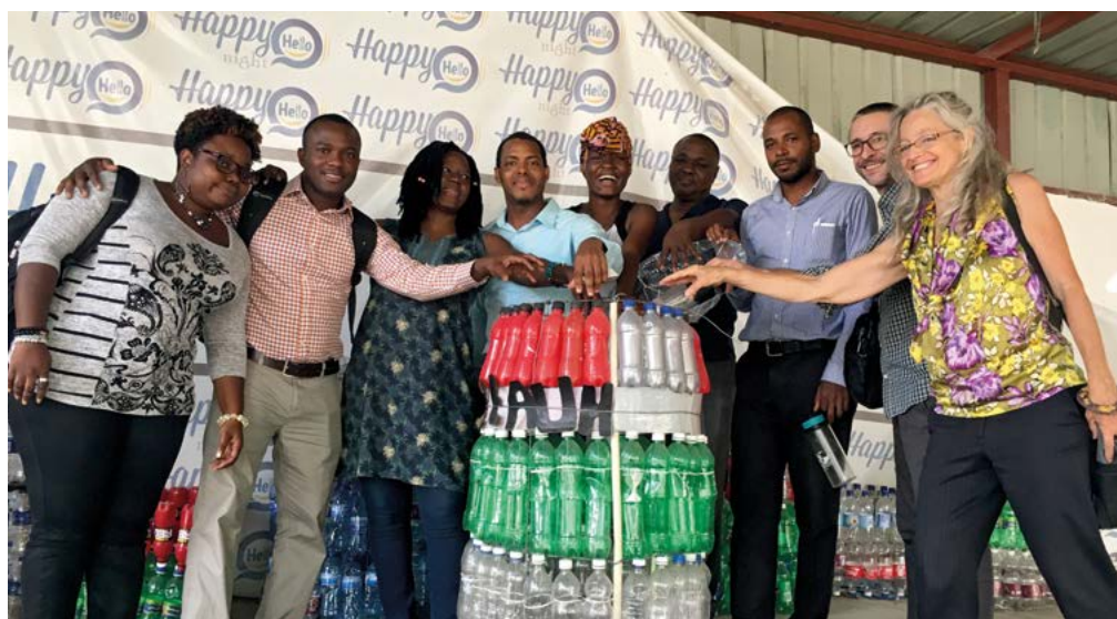
Message in a bottle, campaign against waste, PFR Haiti, August 2018