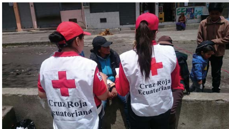
FbF scoping in Ecuador, volcanic ash hazard, April 2018

Red Cross Red Crescent teams are now planning to use forecasts of the movement of volcanic ashfall (in Ecuador ), and cyclones, floods, droughts, cold snaps and heatwaves to reduce the risks of associated disasters and prepare for effective response.