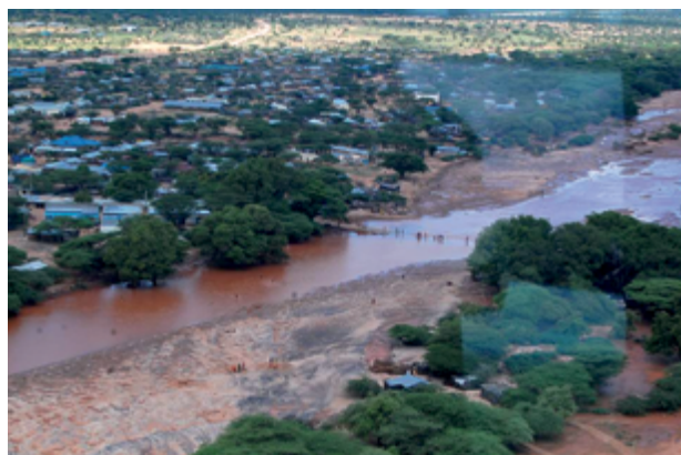
2015 Mogodashe floods in Garrisa County, Kenya - Credit Kenya Red Cross Society

False alarms do, however, appear to impact trust in forecasts at the community level (2). Several informants relayed stories suggesting that the 2014 forecasts eroded trust at the community level. In Kenya for instance, belief that the 2014 El Niño forecast had been inaccurate, led some villagers to “dispute [the 2015 El Niño forecast] ... quoting the earlier ‘forecast’ of the previous year when we were told ‘El Niño is coming,’ and then it never came” (2). For individuals, the implications of acting in vain are potentially much greater than for organizations, and as the result of predictions that do not materialise, individuals appear quick to conclude that “because [El Niño] didn’t happen after the last two [forecasts], we’re not going to rely on this information anymore” (2).