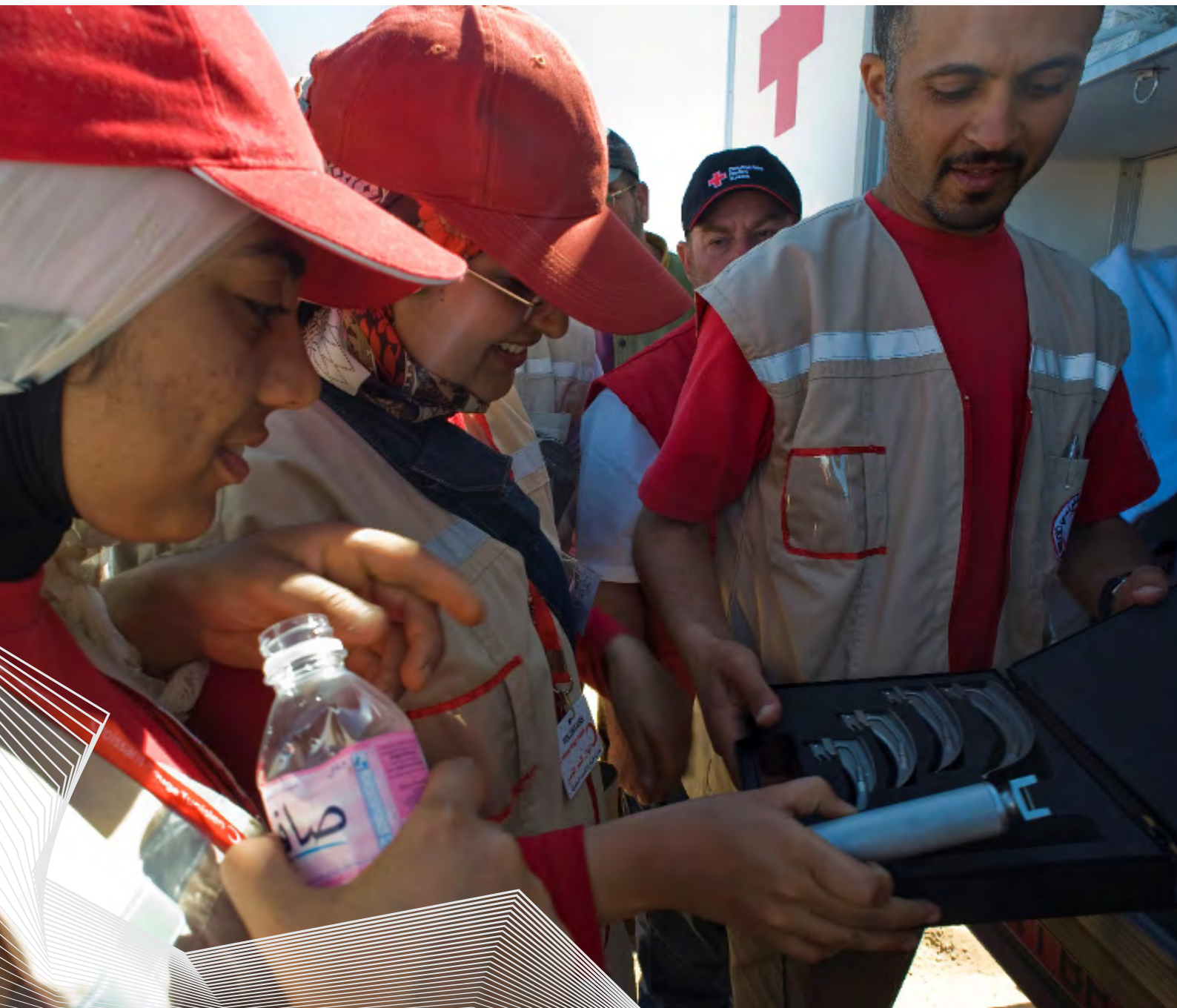
Photo: The International Federation of Red Cross and Red Crescent Societies (IFRC) and health personnel of the Tunisian Red Crescent unload medical supplies donated by the Spanish Red Cross at the IFRC Base Camp near the Libyan border. By Victor Lacken / IFRC, 2011